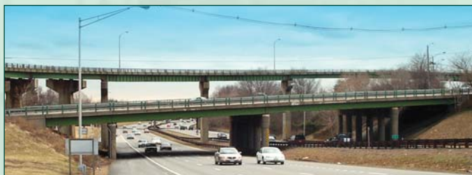
NBIS Inspection of 85 Bridges MP 94.8 to 168 - NJTA /GSP DIV