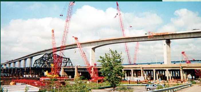
Construction Inspection Services for the Victory Bridge / Route 35 Replacement over the Raritan River - NJDOT