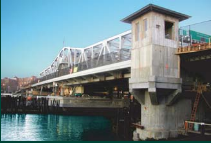
Construction Inspection for the Replacement of the Third Avenue Swing Bridge Over the Harlem River - NYCDOT