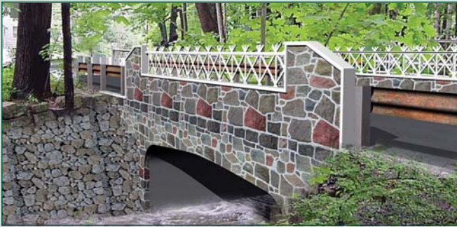
Rendering of Stephensburg Road Bridge Design - Morris County