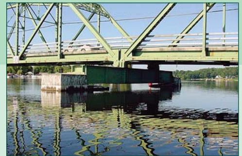
Underwater Inspection of over 150 Structures in Regions 1, 2, 7, 8, & 9 - NYSDOT

While our infrastructure matures at a rapid pace, many of our rural and urban bridges, viaducts and culverts are in need of significant repair, rehabilitation or replacement. KSE is performing much needed condition surveys, NBIS, biennial and structural integrity inspections, load ratings, fatigue analyses, scour analyses of over water structures, and has developed computerized bridge information systems to extend the life of these valuable assets. Our services have ranged from the provision of team leaders and full inspection teams through complete project management, on both minor and major bridges, viaducts, elevated structures and culverts. We have strong credentials as prime, and can also add value to your team on your next assignment.