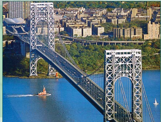
Biennial Inspection & Condition Survey of George Washington Bridge Main Span and NY Approach Spans - PANY/NJ

From concept development to final design, KSE provides the background, skill and experience necessary to provide our clients with performance-based achievements and an established reputation for quality and innovation in bridge engineering and design. Our structural engineers, combined with our traffic and survey staff, provide extensive capabilities in the rehabilitation of existing structures and in the aesthetic design and construction of new and replacement steel, concrete and timber structures including pre-stressed, post-tensioned and curved girder bridges. KSE works closely with all agencies, owners and community groups to ensure the successful completion of assignments, while working in concert with all members of the project team. Our corporate philosophy is based on a total commitment to quality and teamwork to get the project right the first time, every time.