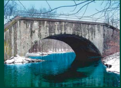
Inspection, Load Rating and Design of Port Jervis Line Undergrade Bridges - MTA / MNRR