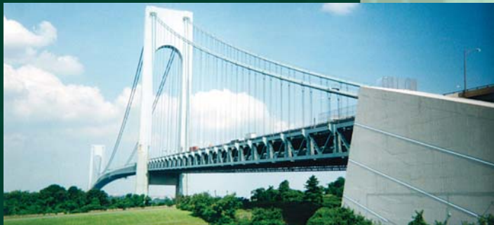
Verrazano-Narrows Bridge Biennial Inspection, Inventory and Load Rating Including Towers, Deck & Lower Roadway - MTA/B&T