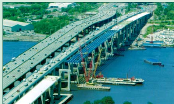
Prime Construction Engineering Consultant for New Route 9 Southbound Bridge Over Raritan River - NJDOT