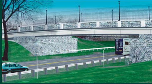
Design & Construction Inspection of Three Lincoln Park Bridges Hudson County