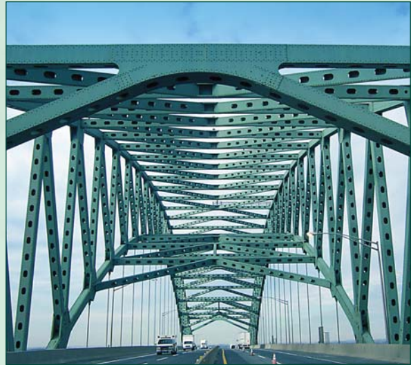
Structural Inspection & Design of Delaware River Bridge Deck Reconstruction - NJ Turnpike