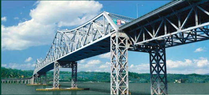
Tappan Zee Bridge / I-287 Corridor Alternatives Analysis / EIS - NYS Thruway