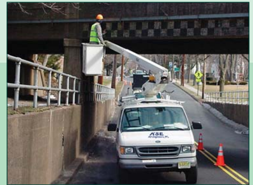
Indepth Inspection and Load Rating of 59 Undergrade Bridges - NJ Transit