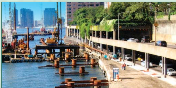
Construction Inspection for the FDR Drive Southbound Roadway Reconstruction and Outboard Roadway Reconstruction - NYSDOT